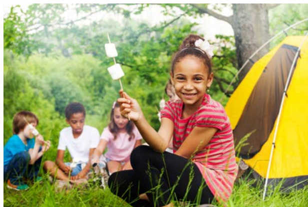
Campers make lasting memories in the great outdoors.

Camp Bennett continues its original mission of encouraging children by providing five-day, four-night camp sessions for children from underprivileged families from June 28 to August 13, 2021. For some of these city kids, this will be the first time they’ve slept away from home and in a wooded setting. The summer’s theme is “FORGIVEN!,” exploring the “Prodigal Son”