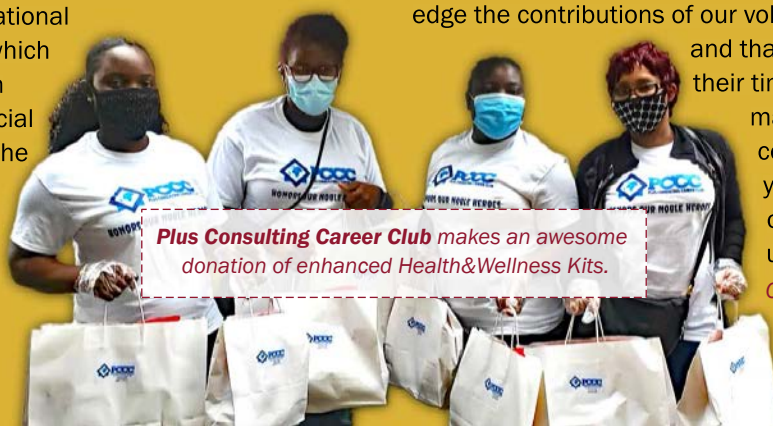
Plus Consulting Career Club makes an awesome donation of enhanced Health&Wellness Kits.

Everyone has weathered a full year of the COVID-19 pandemic, and at the Mission, we gratefully acknowledge the contributions of our volunteers. We recognize and thank those who lend their time, talent and voice to make a difference in the community. This past year has taxed everyone’s creativity, as volunteers have been un- Continues on page 5